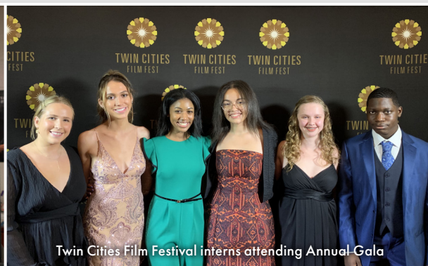
Twin Cities Film Festival interns attending Annual-Gala