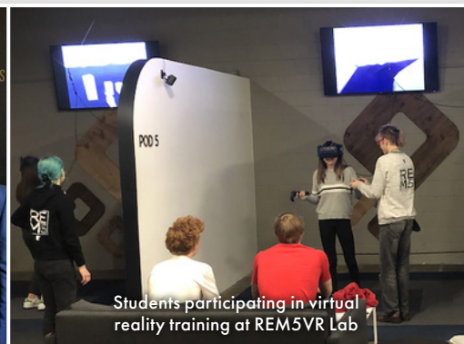
Students participating in virtual reality training at REM5VR Lab

Interested in learning more about EPIC? Contact Steve Pohlen at 612-618-2419 or spohlen@bsmschool.org .