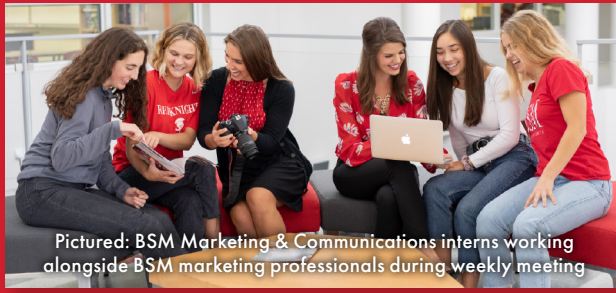
Pictured: BSM Marketing & Communications interns working alongside BSM marketing professionals during weekly meeting