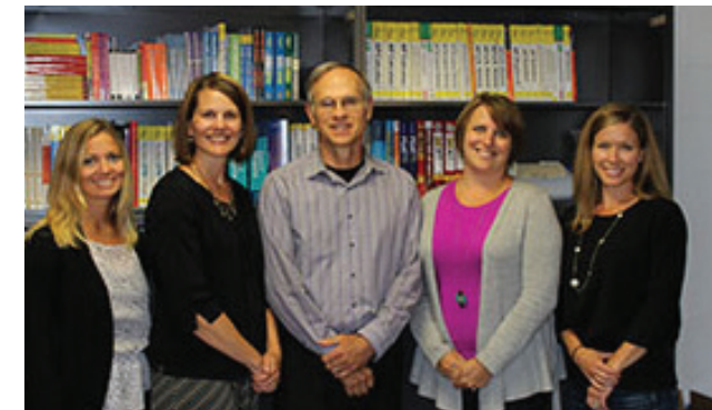
BSM's Guidance and College Counselors individually assist all Red Knights in setting and reaching goals for successful futures.

The BSM College and Career Center is a resource center for both students and parents. The counselors and trained parent volunteers, staff the College and Career Center and are available to assist our Red Knight families. There are approximately 200 college representatives who visit with interested students each year in the College and Career Center.