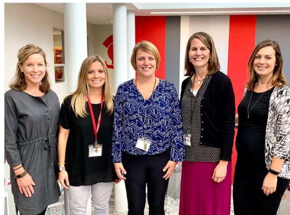
BSM's Guidance and College Counselors individually assist all Red Knights in setting and reaching goals for successful futures.

The BSM College and Career Center is a resource center for both students and parents. The counselors and trained parent volunteers staff the College and Career Center and are available to assist our Red Knight families. There are approximately 200 college representatives who visit with interested students each year in the College and Career Center.