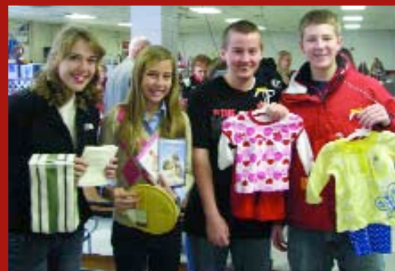
Last year, students donated a variety of items to their adopted families.

While this project is incredibly meaningful to BSM participants, the families are equally grateful. One family last year sent a thank you message that included, "As difficult as this time has been for us, God has been answering our prayers. This Christmas, you were God's answer."