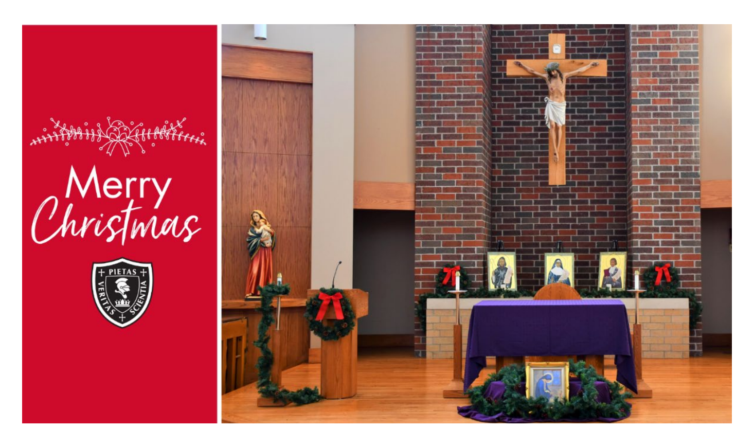
<u>December 27, 2020</u> The Holy Family - Jesus, Mary, and Joseph

"When they had fulfilled all the prescriptions of the law of the Lord, they returned to Galilee, to their town of Nazareth. The child grew and became strong, filled with wisdom; and the favor of God was upon him." Luke 2:40